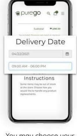
You may choose your you will find your cart preferred delivery date & time