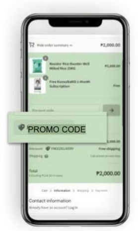
And proceed with clicking the yellow button to apply your discount