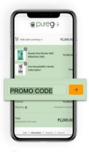
Type in your unique promo code in the order summary